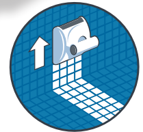
Floor & Wall Cleaning