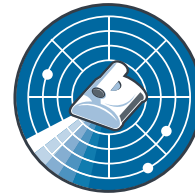
CleverClean scanning system